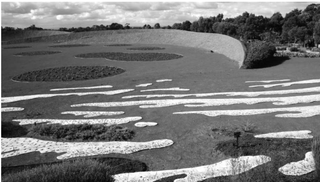
Australian Garden, Cranbourne Botanical Gardens