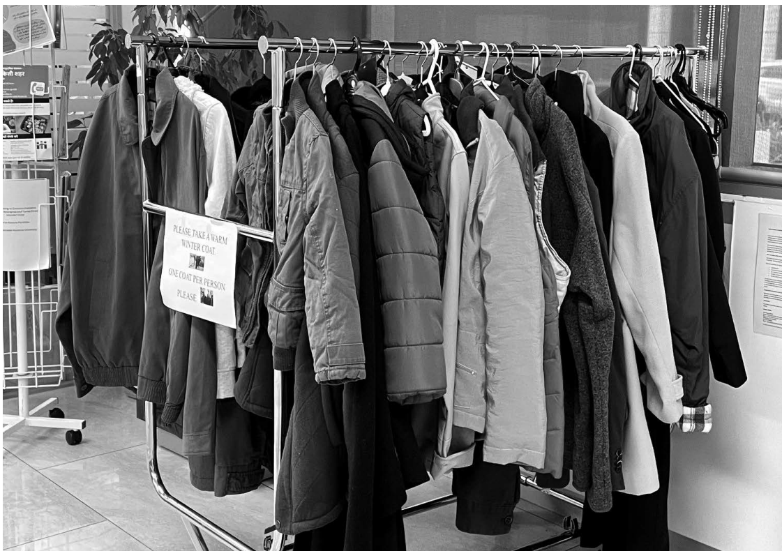
Each year Casey North CISS holds a Winter Coat Drive, clients can select a coat to suit from the rack in Reception.

An employment rights legal centre which provides assistance to Victorian workers about their rights at work.