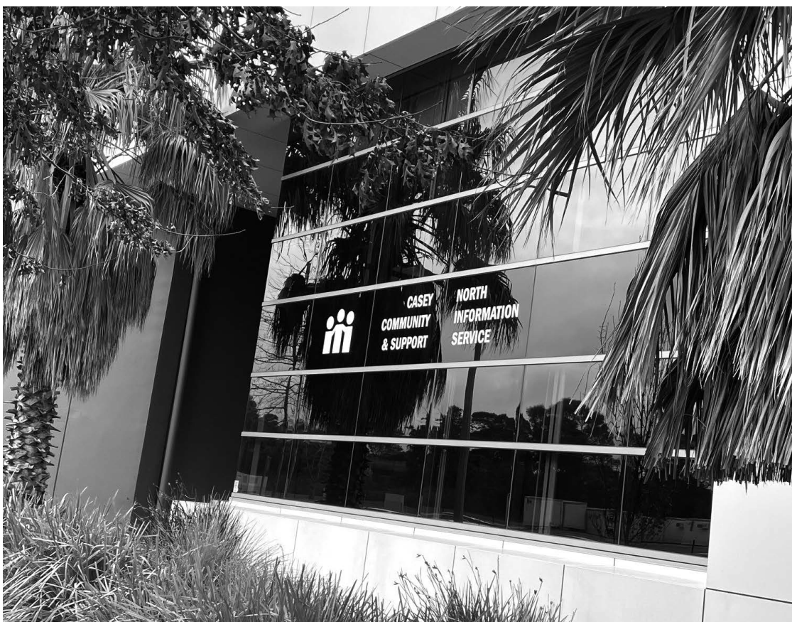
Casey North Community Information and Support Service 2, 30-32 Verdun Drive, Narre Warren.

Add a good-sized splash of white distilled vinegar to soapy water.